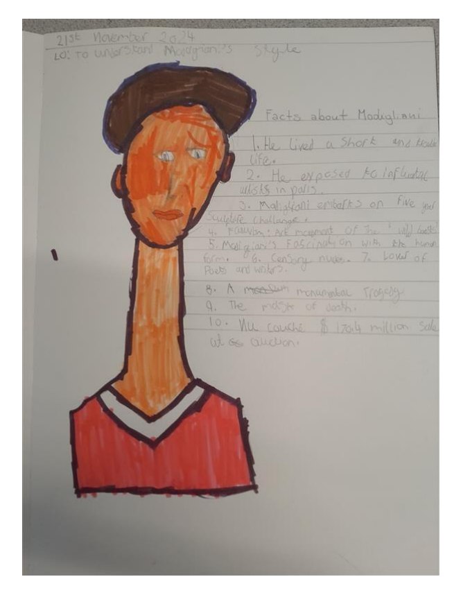
2 - Richie-Ray created a wonderful interpretation of Modigliani's art work, now proudly displayed in the Principal's office. Our learner's have an impressive repertoire of artistic skills and our school buildings are adorned with their super work.

1 - Learners have been competing to complete their Pen Licences throughout Autumn. They were required to show an extended piece of work, presented well that resulted in a certificate and a fountain pen.