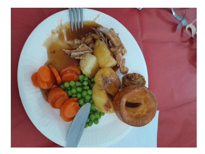
9 - Christmas dinner dished up!