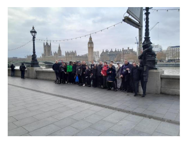
8 - Learners were in for a spooky treat this Halloween, as they made their way through the streets of London to The London Dungeons - many saw London landmarks for the first time and were awe inspired by London scenes, lit up for Christmas. Excellent behaviour throughout, with some learners engaging in chit chat with some elderly passengers on the train and bus there.

7 - On 12th November, we joined the Anti-Bullying Alliance in their campaign to eradicate bullying. Learners made posters and completed tasks in Core Skills sessions where they worked to understand what constitutes as bullying and ways to become an ally for those who are persecuted. Staff joined in by wearing a wonderful collection of odd socks!