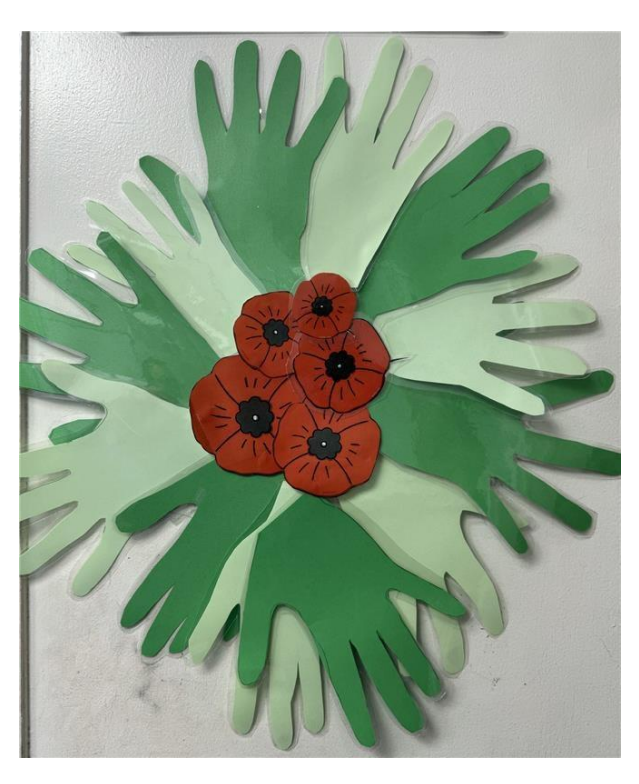
5 - Remembrance Sunday was acknowledged by staff and learners by creating posters that recognised the sacrifice and contributions made in World War I & II.

SMSC ~ Social, Moral, Spiritual and Cultural activities